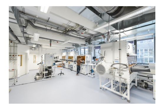
A look inside the Helmholtz Innovation Lab HySPRINT. Major work on the printable perovskite-LEDs was carried out here.